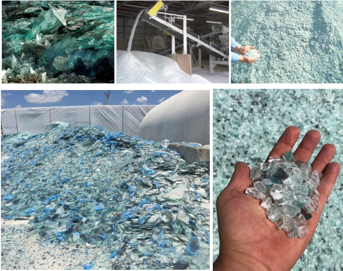
Figure 2: Examples of Crushed Glass in recycling facilities