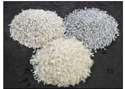
Figure 4: Example of recycled PVB

Laminated glass is frequently used in architectural applications that require lamination as a measure of security, by code, or simply for aesthetic reasons. It is now possible to recycle both laminated glass and PVB interlayer by separating them. After PVB is separated from glass, the glass portion becomes a clean cullet supply. The PVB is made into different sizes or forms, such as fleck, pallet, liquid, or new film. The main consumer of recycled PVB is the carpet industry, which uses recycled PVB as part of the carpet backing. See Figure 4 for an example of recycled PVB.