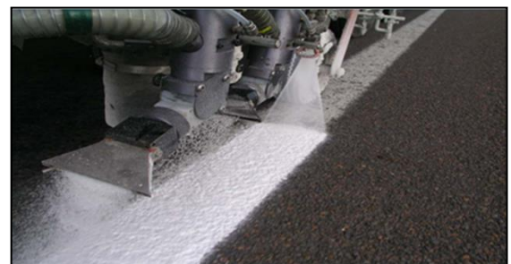
Figure 3: Example of recycled glass used in highway paint

The sand and coal slag industry faces increased government regulation due to hazardous health concerns related to their products. Crushed glass has become accepted as a high performing safe alternative. Glass is crushed, separated by mesh size, and then sold to blasting distributors and contractors who use it to clean and prepare metal surfaces for painting.